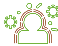
Healthy Inflammation Response